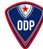
Oregon ODP www.oregonyouthsoccer.org