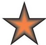
Trops FC www.trops.com.br