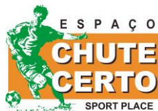
Espaco Chute Certo www.espacochutecerto.com.br