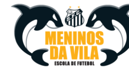
Meninos da Vila Santos https://www.meninosdavidasantos.com.br/